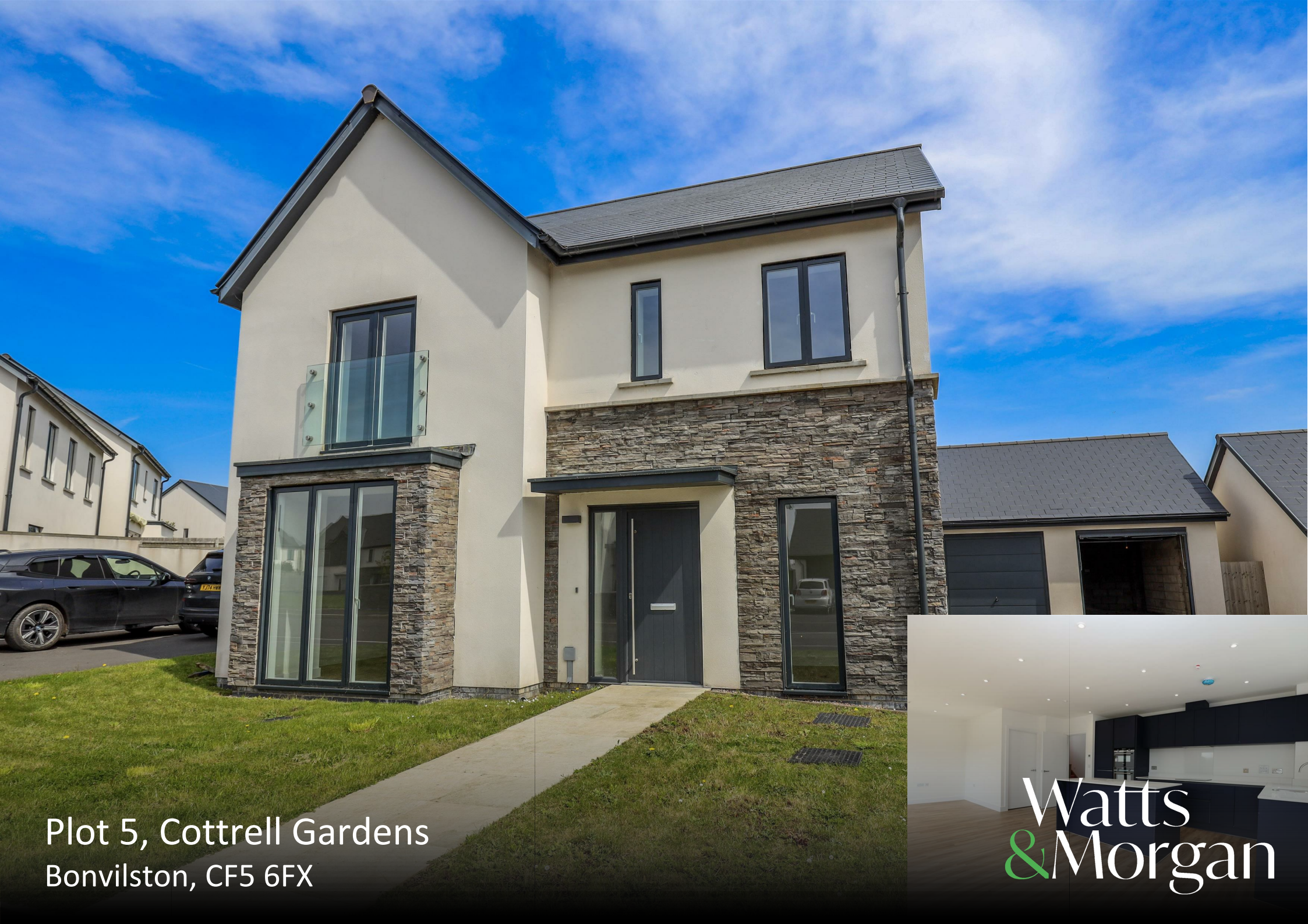
Plot 5, Cottrell Gardens Bonvilston, CF5 6FX